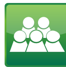
Up to 5 users

Yealink's next generation W52P is a Cordless SIP Phone which is designed for Small-to-Medium sized businesses who are looking for an immediate cost saving, but scalable SIP-based mobile communication system. By combining the benefits of wireless communication with rich business features of VoIP telephony the user will benefit from professional features which includes DECT cordless technology, HD voice communication, multi-tasking convenience and features like intercom, call transferring, call forwarding, 3-way conferencing, PoE, etc.