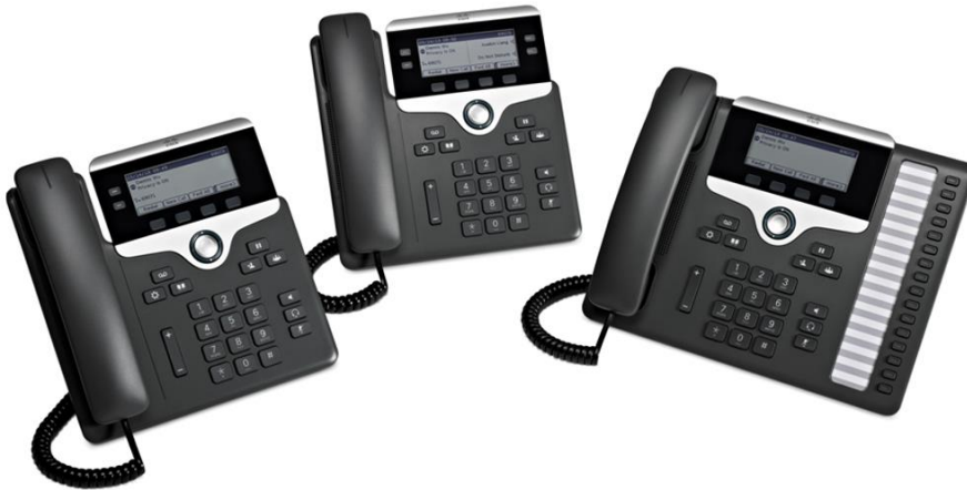
Figure 1. Cisco IP Phone 7800 Series

The line keys on each model are fully programmable. You can set up keys to support either lines, such as directory numbers, or call features like speed dialing. You can also boost productivity by handling multiple calls for each directory number, using the multi-call per-line appearance feature. Tri-color LEDs on the line keys support this feature and make the phone simpler and easy to use.